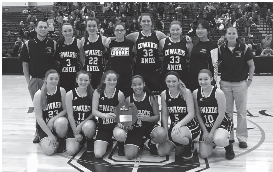
Overall Section X Champions

Started the Trudeau Family Farm in 2004 2004 received Master of Science in Education from SUNY Potsdam 2003 received Bachelor of Arts in Biology and Secondary Education at SUNY Potsdam 2000 Graduated from Jefferson Community College with Liberal Arts degree 1997-2003 Worked as a certified laboratory technician at the Samaritan Medical Center 1995-1996 received certification from the NCA 1992 Graduated from Carthage Central School with a Regents diploma